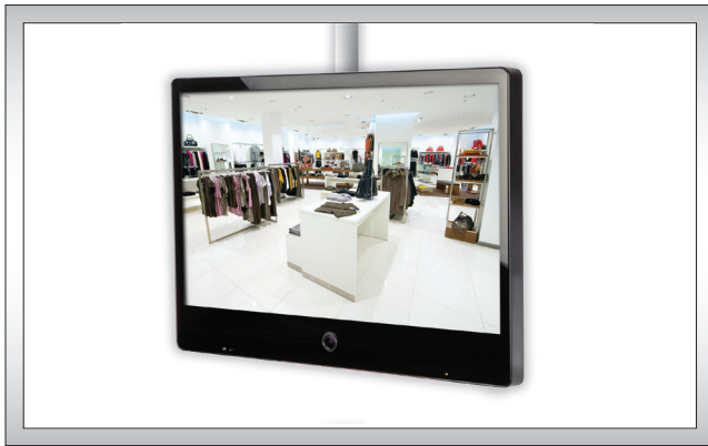
Ceiling mount shown attached (not included)