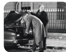
True Day/Night B/W Mode in Low Light Conditions