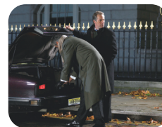
Enhanced Color Mode In Low Light Conditions