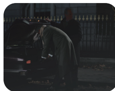
Normal Color Mode In Low Light Conditions

S.I.E. 2 - our 2nd generation 'Super Image Enhancer' module enhances the clarity and color accuracy of its predecessor by further refining our proprietary DSP technology. This new unique video processing technology radically enhances the low light performance of the EasyView™ 2 dome camera by utilizing super low light features such as DSS, DNR, Super BLC, AWB, and BMB, delivering excellent picture quality and higher resolution at 580 TV Lines.