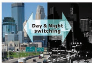
Day and Night Mode