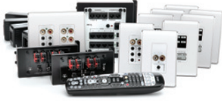
AU5646-WH LyriQ High Performance Multi-Source, 6-Zone Kit in Studio Design