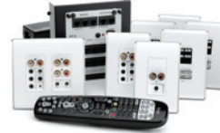
AU5544-WH LyriQ Multi-Source, 4-Zone Kit in Studio Design