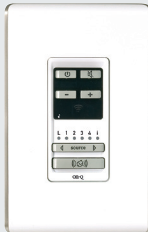
LyriQ Keypad (AU5009-XX)

Based on Cat 5 cabling, the LyriQ Audio System includes easy installation features such as convenient RJ45 connections.