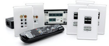
AU5514-WH LyriQ Single-Source, 4-Zone Kit in Studio Design