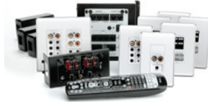
AU5644-WH LyriQ High Performance Multi-Source, 4-Zone Kit in Studio Design