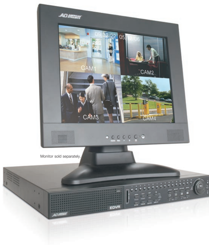
Monitor sold separately.