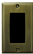
Antique Brass (232)