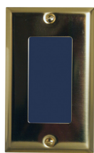
Polished Brass (222)