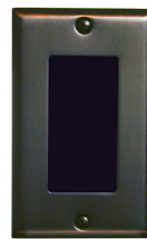
Oil-Rubbed Bronze (252)