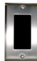
Satin Nickel (302)