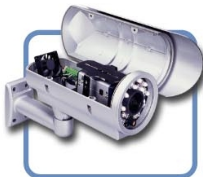
Housing with IR LED