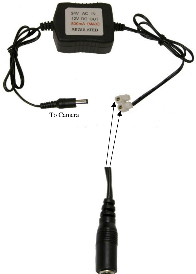
To Extension Cable