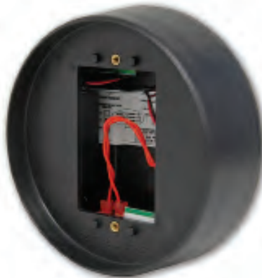
104753-R4 - 4" Round Box/Transmitter 104753-R6 - 6" Round Box/Transmitter