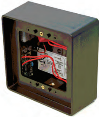
104753 - 4" Box/Transmitter

The 104753 Transmitter provides the most reliable wireless activation of automatic doors available.