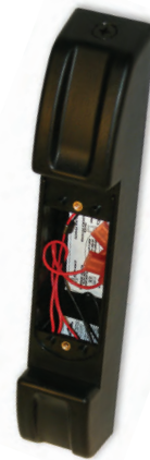
104753-J Jamb Mount Box/Transmitter