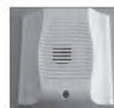
External Sounder provided with base model (DE8310)