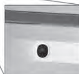
Available with a Discreet Built-in Camera

Dimensions include 1/4" (6mm) mounting bracket