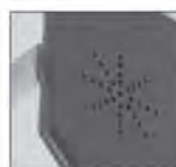
Available with a Built-in Sounder