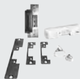
DK-1 Door Hardware Kit