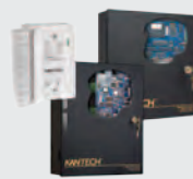
Kantech Door Controller Family