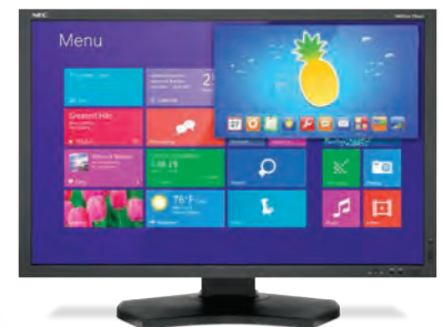
Picture in Picture shown with 2 separate inputs