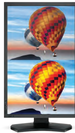
Picture by Picture

The PA271Q allows for two different inputs to be shown simultaneously, which is useful for multiple computer configurations or even replacing multiple display setups. The same input can also be displayed in a second color space, which is most often used for a quick preview of an output color space (for example, sRGB) while working in a different color space (for example, Adobe RGB). This saves the time used to switch back and forth between color spaces as final editing tweaks are made.