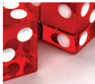
10 bit color eliminates banding

The MultiSync PA271Q offers 10 bit color support over DisplayPort and HDMI inputs for increased color fidelity when matched with a 10 bit operating system and software applications.